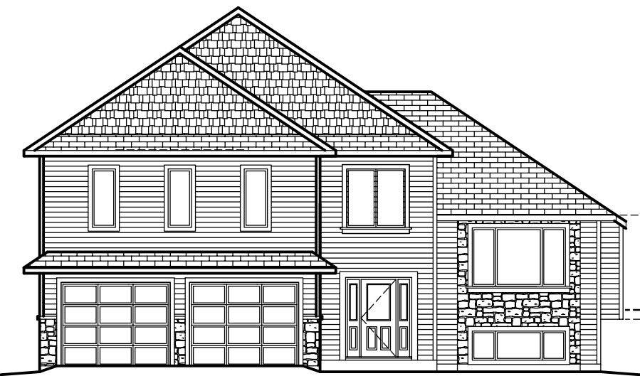
1 FRONT ELEVATION 1738 SQ. FT. SCALE: 1/4" = 1'-0"